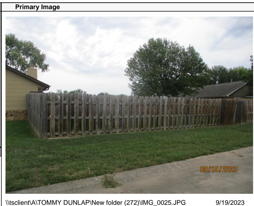
\\tsclient\A\TOMMY DUNLAP\New folder (272)\IMG_0025.JPG 9/19/2023