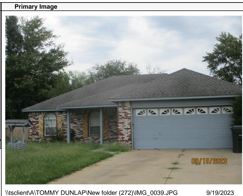
\\tsclient\A\TOMMY DUNLAP\New folder (272)\IMG_0039.JPG 9/19/2023