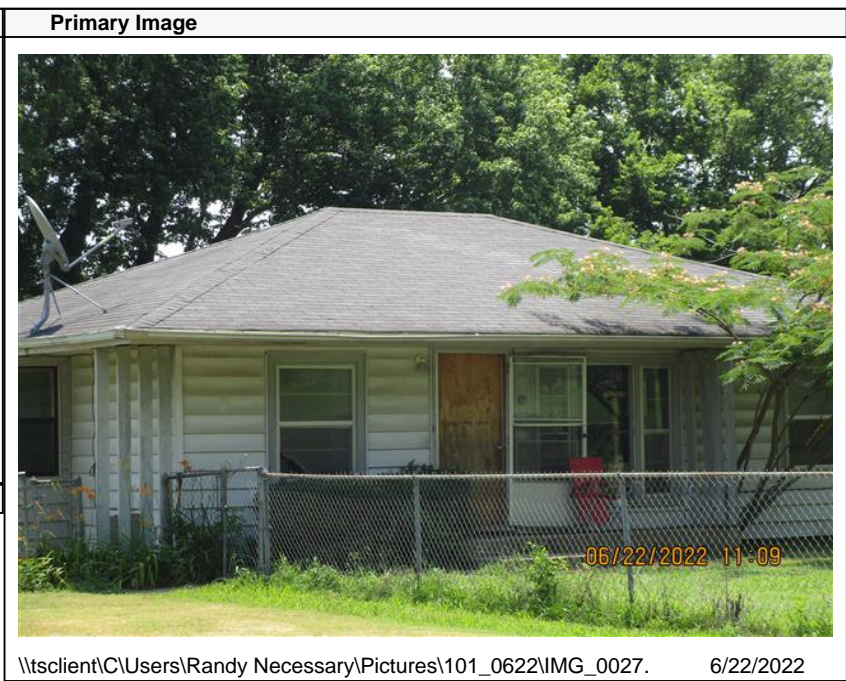
\\tsclient\C\Users\Randy Necessary\Pictures\101_0622\IMG_0027. 6/22/2022