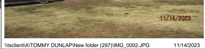
\\tsclient\A\TOMMY DUNLAP\New folder (297)\IMG_0002.JPG 11/14/2023