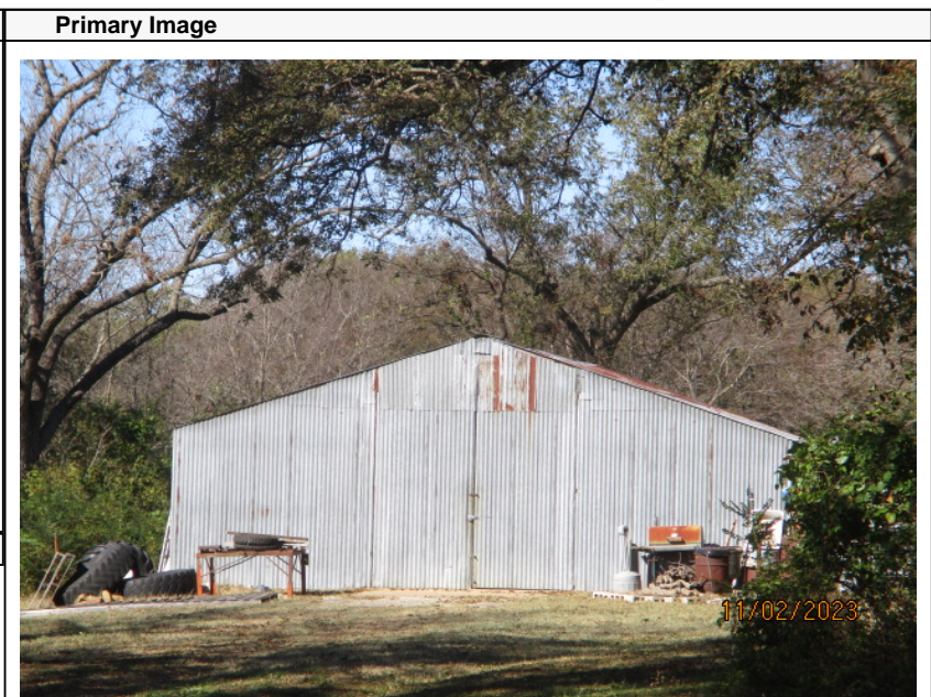
\\tsclient\A\TOMMY DUNLAP\New folder (291)\IMG_0031.JPG 11/3/2023