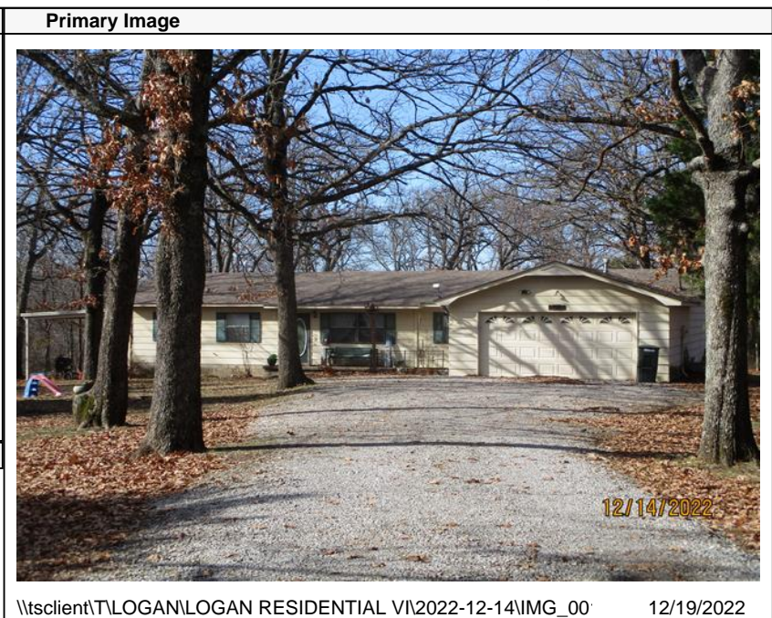
\\tsclient\T\LOGAN\LOGAN RESIDENTIAL VI\2022-12-14\IMG_00 12/19/2022