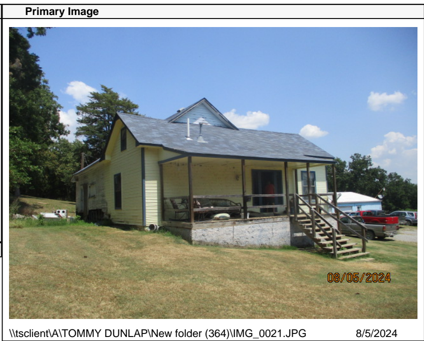
\\tsclient\A\TOMMY DUNLAP\New folder (364)\IMG_0021.JPG 8/5/2024