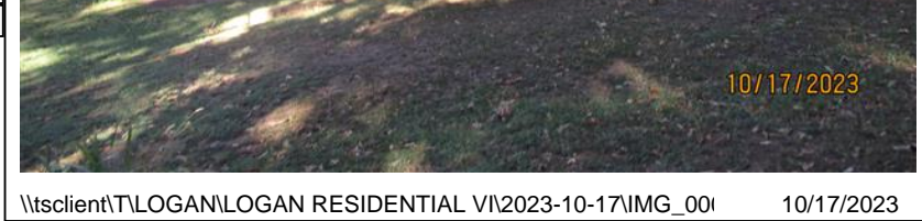
\\tsclient\T\LOGAN\LOGAN RESIDENTIAL VI\2023-10-17\IMG_001 10/17/2023