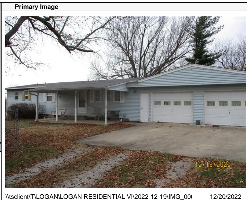
\\tsclient\T\LOGAN\LOGAN RESIDENTIAL VI\2022-12-19\IMG_001 12/20/2022