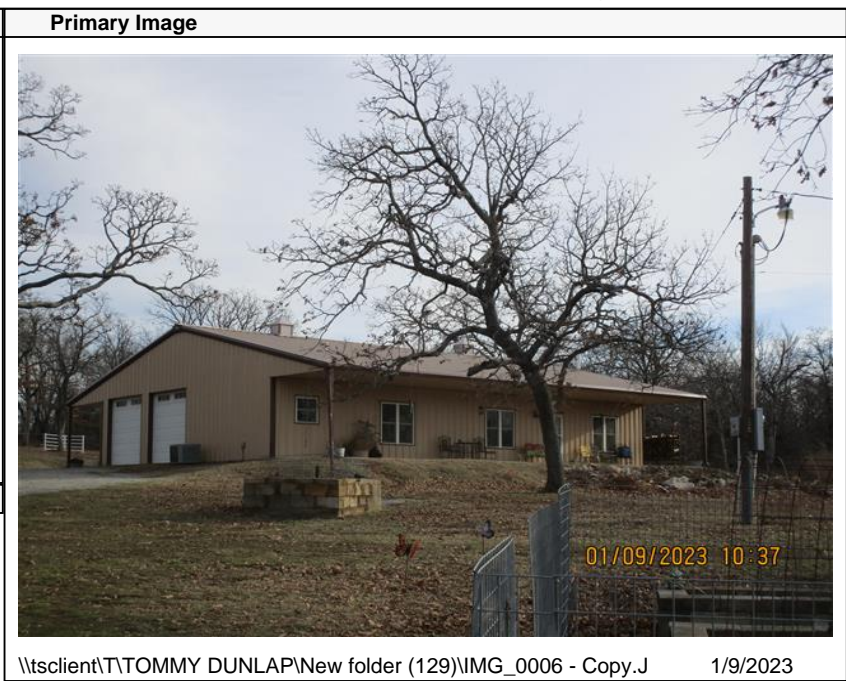
\\tsclient\T\TOMMY DUNLAP\New folder (129)\IMG_0006 - Copy.J 1/9/2023