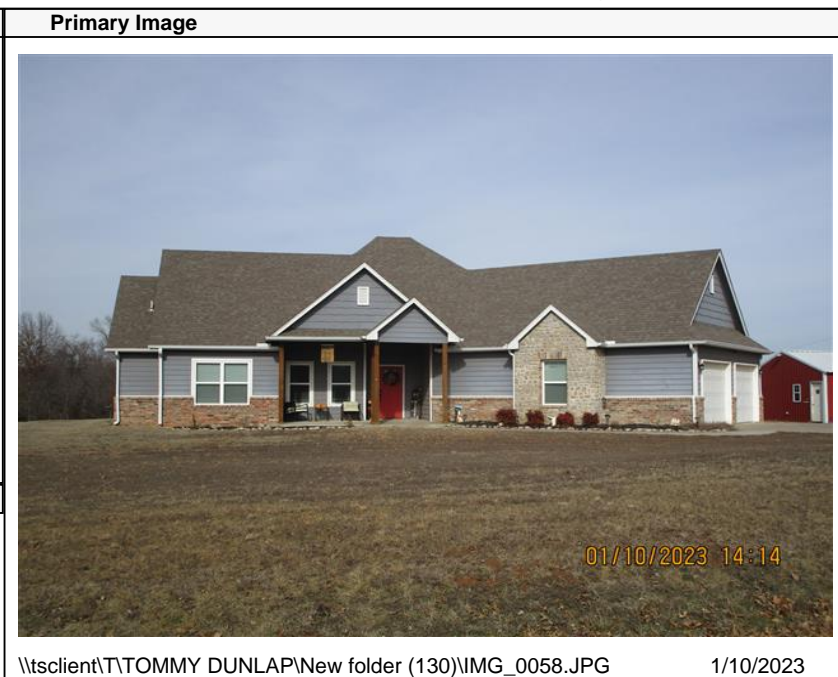
\\tsclient\T\TOMMY DUNLAP\New folder (130)\IMG_0058.JPG 1/10/2023