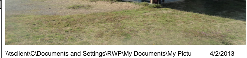
\\tsclient\C\Documents and Settings\RWP\My Documents\My Pictu 4/2/2013