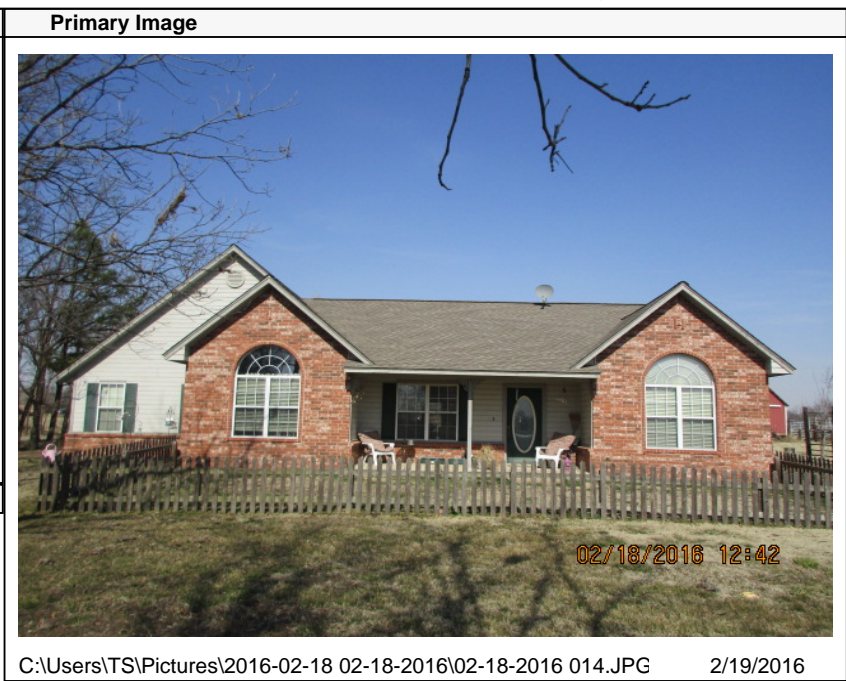
C:\Users\TS\Pictures\2016-02-18 02-18-2016\02-18-2016 014.JPG 2/19/2016