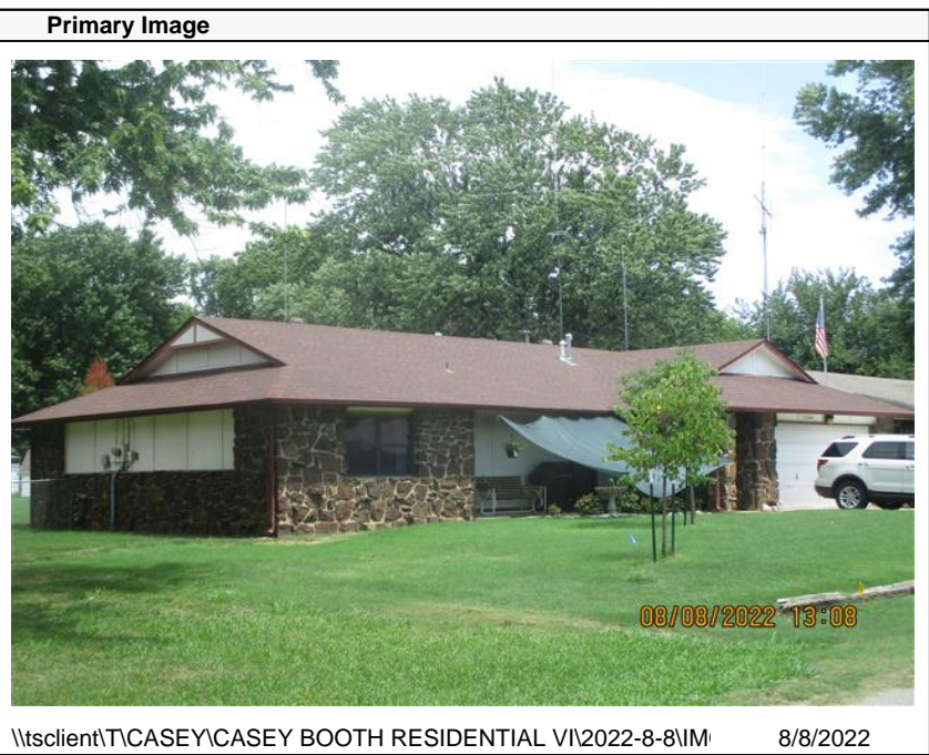
\\tsclient\TCASEY\CASEY BOOTH RESIDENTIAL VI\2022-8-8\IM 8/8/2022