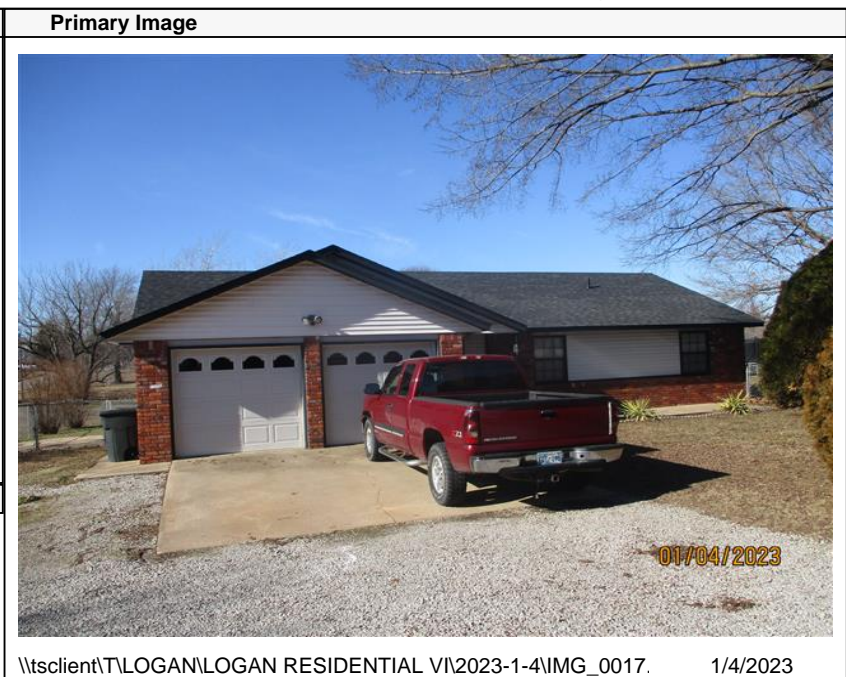
\\tsclient\T\LOGAN\LOGAN RESIDENTIAL VI\2023-1-4\IMG_0017. 1/4/2023