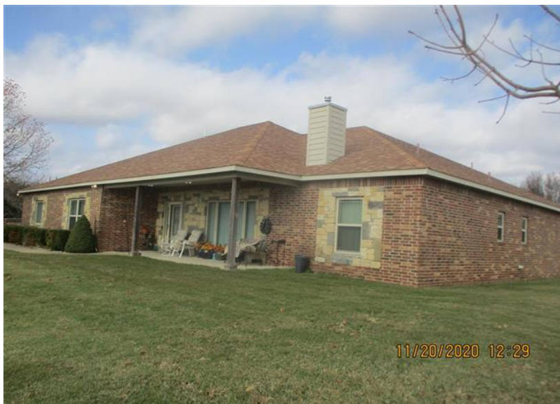
\\tsclient\TCASEY\CASEY BOOTH VISUAL INSPECTION\2020-1' 11/20/2020