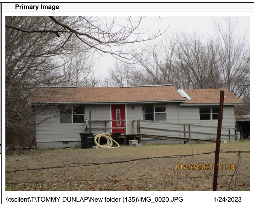
\\tsclient\T\TOMMY DUNLAP\New folder (135)\IMG_0020.JPG 1/24/2023