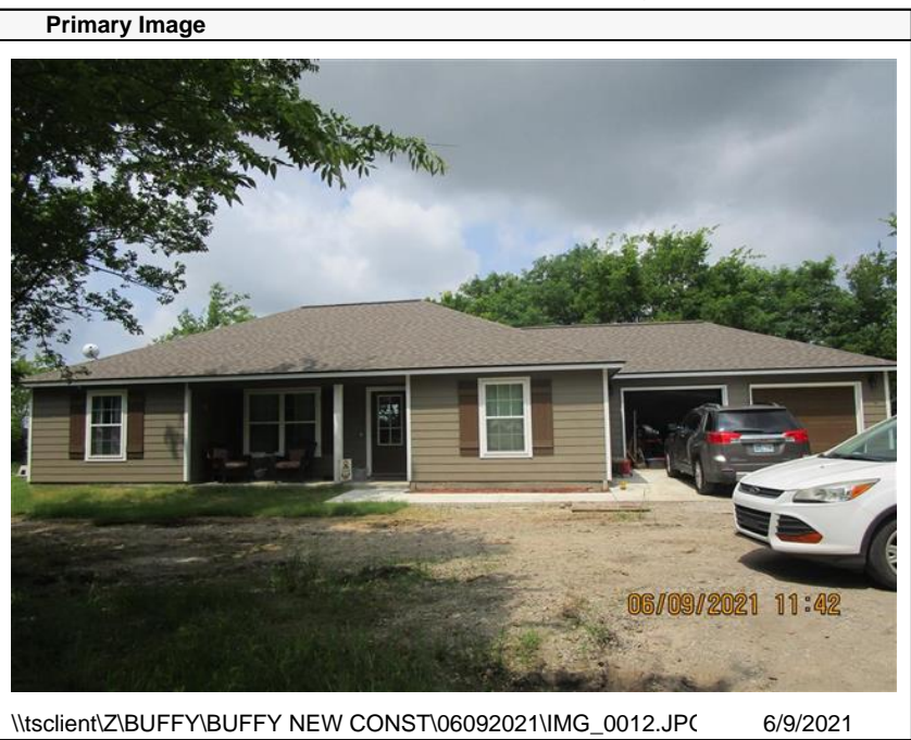
\\tsclient\Z\BUFFY\BUFFY NEW CONST\06092021\IMG_0012.JPG 6/9/2021