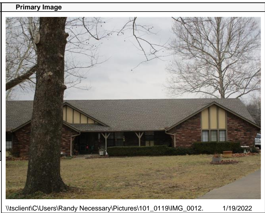
\\tsclient\C\Users\Randy Necessary\Pictures\101_0119\IMG_0012. 1/19/2022