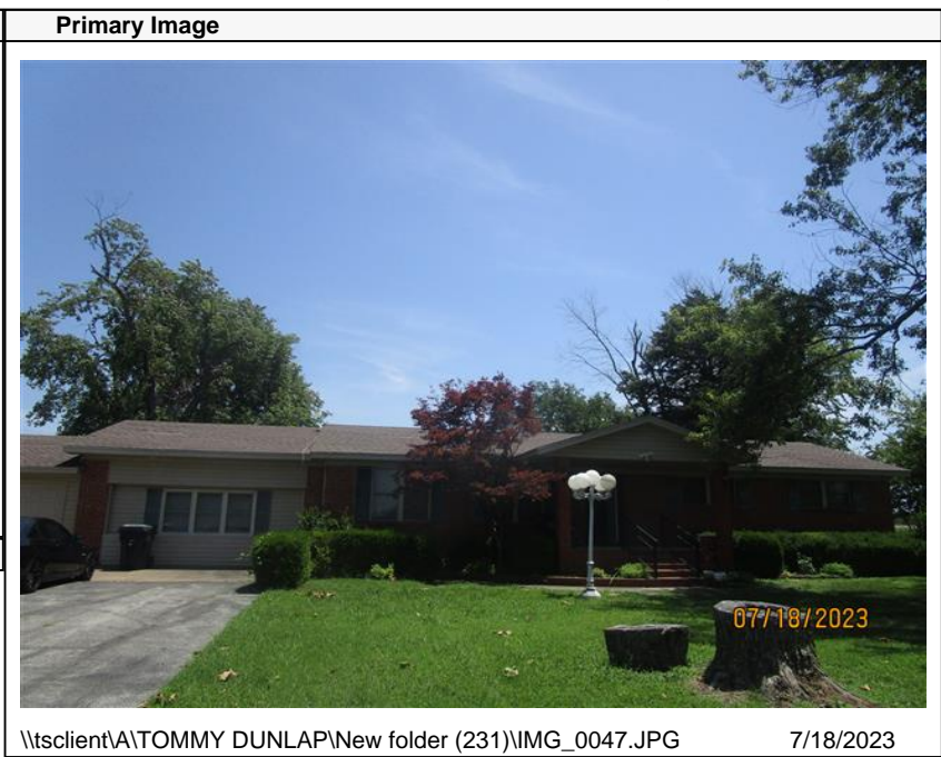
\\tsclient\A\TOMMY DUNLAP\New folder (231)\IMG_0047.JPG 7/18/2023