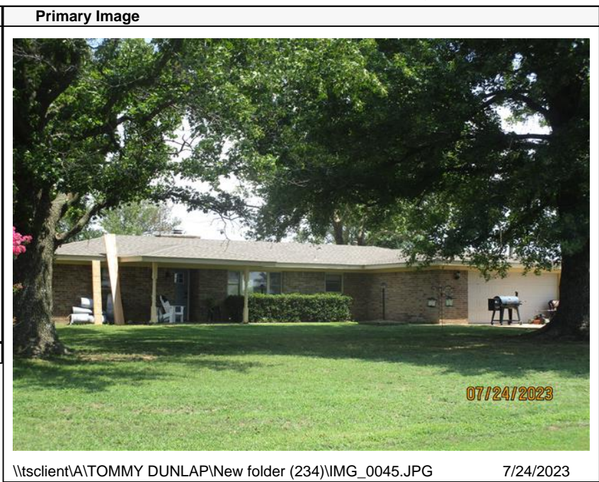
\\tsclient\A\TOMMY DUNLAP\New folder (234)\IMG_0045.JPG 7/24/2023