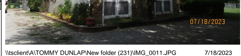
\\tsclient\A\TOMMY DUNLAP\New folder (231)\IMG_0011.JPG 7/18/2023