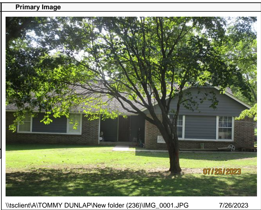
\\tsclient\A\TOMMY DUNLAP\New folder (236)\IMG_0001.JPG 7/26/2023