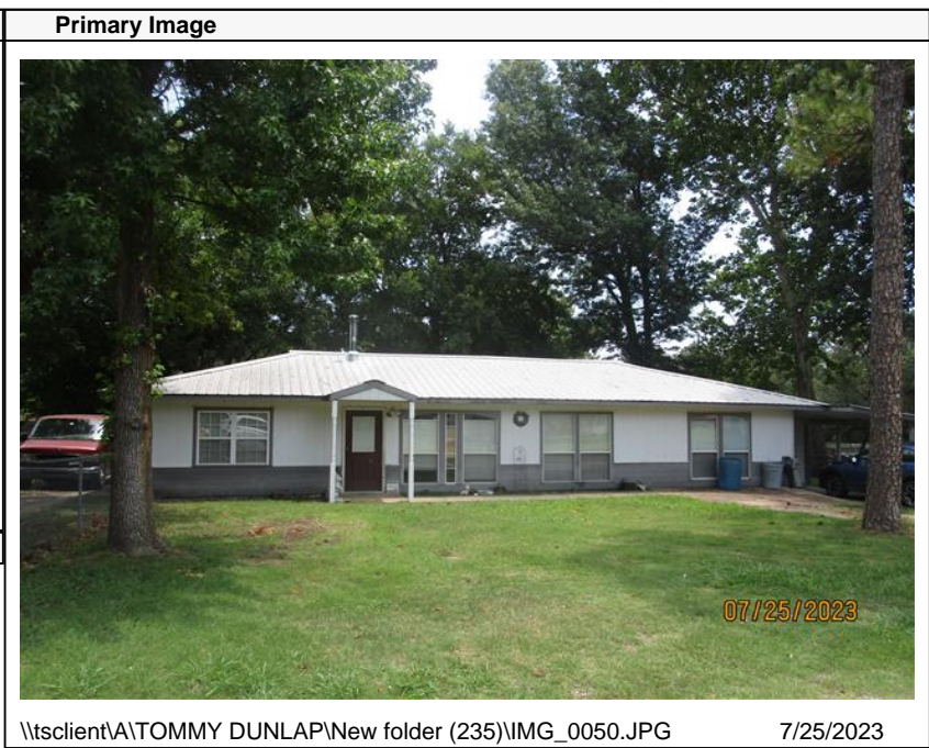
\\tsclient\A\TOMMY DUNLAP\New folder (235)\IMG_0050.JPG 7/25/2023