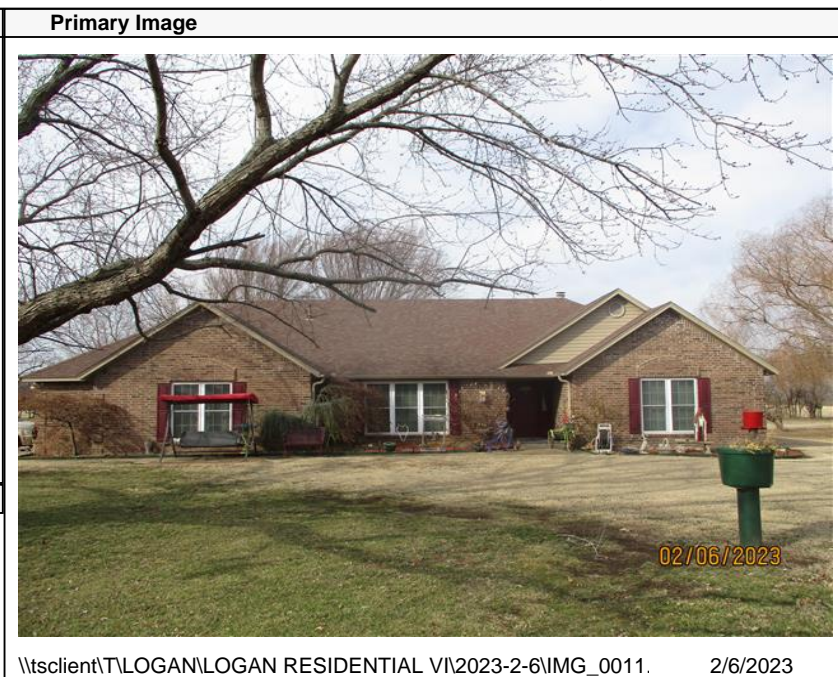
\\tsclient\T\LOGAN\LOGAN RESIDENTIAL VI\2023-2-6\IMG_0011. 2/6/2023