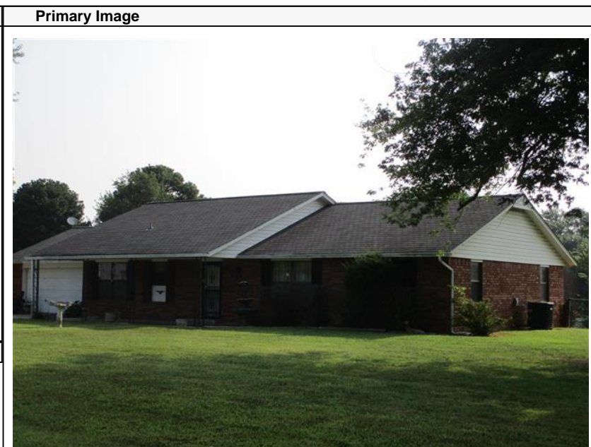
D:\Appraisers\JAYSON\JAYSON RESIDENTIAL VI\2021-8-6\IMG_ 8/6/2021