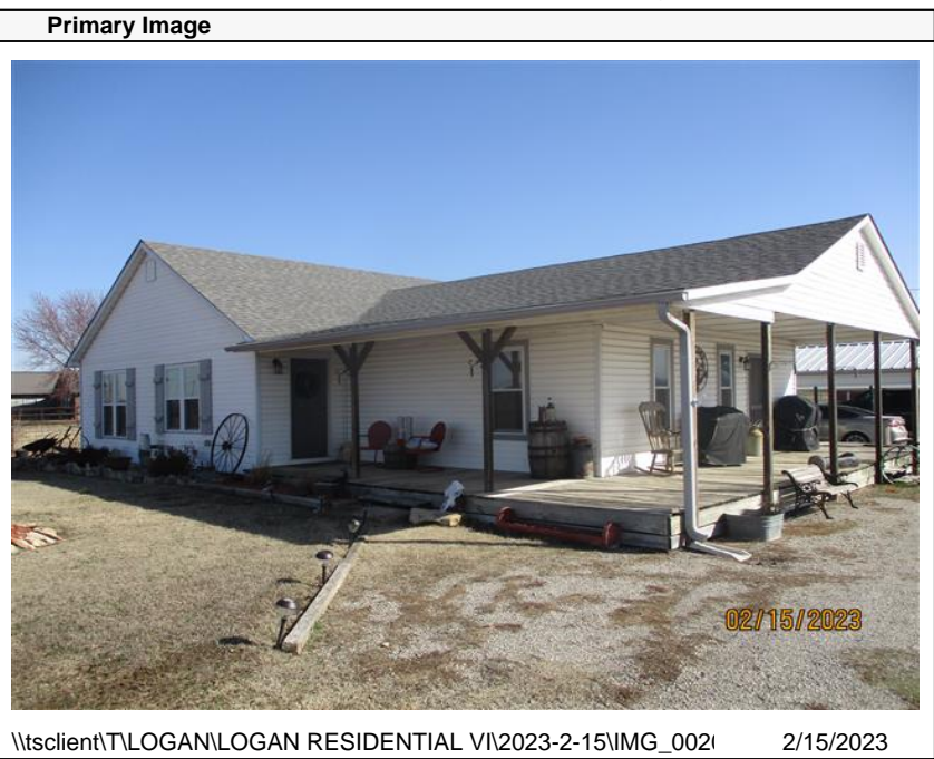
\\tsclient\T\LOGAN\LOGAN RESIDENTIAL VI\2023-2-15\IMG_002I 2/15/2023