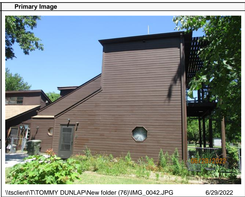
\\tsclient\T\TOMMY DUNLAP\New folder (76)\IMG_0042.JPG 6/29/2022