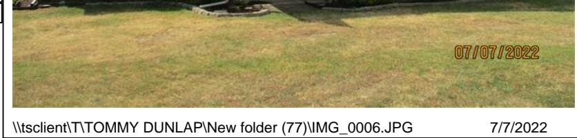
\\tsclient\T\TOMMY DUNLAP\New folder (77)\IMG_0006.JPG 7/7/2022