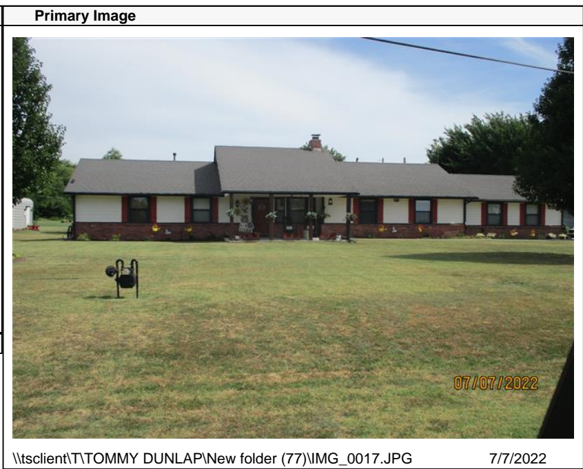
\\tsclient\T\TOMMY DUNLAP\New folder (77)\IMG_0017.JPG 7/7/2022