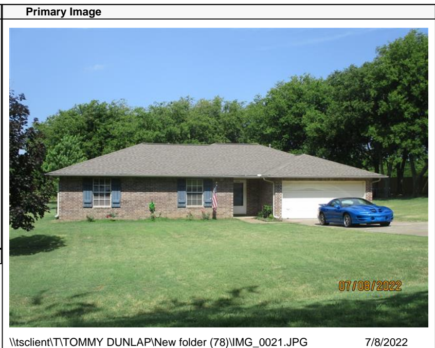
\\tsclient\T\TOMMY DUNLAP\New folder (78)\IMG_0021.JPG 7/8/2022