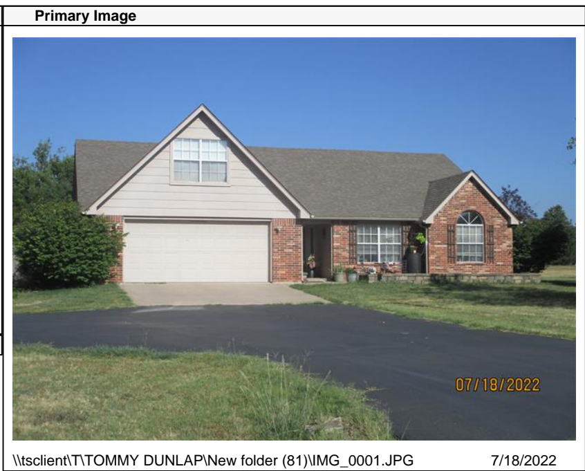
\\tsclient\T\TOMMY DUNLAP\New folder (81)\IMG_0001.JPG 7/18/2022