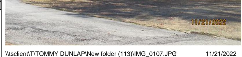
\\tsclient\T\TOMMY DUNLAP\New folder (113)\IMG_0107.JPG 11/21/2022