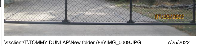
\\tsclient\T\TOMMY DUNLAP\New folder (86)\IMG_0009.JPG 7/25/2022