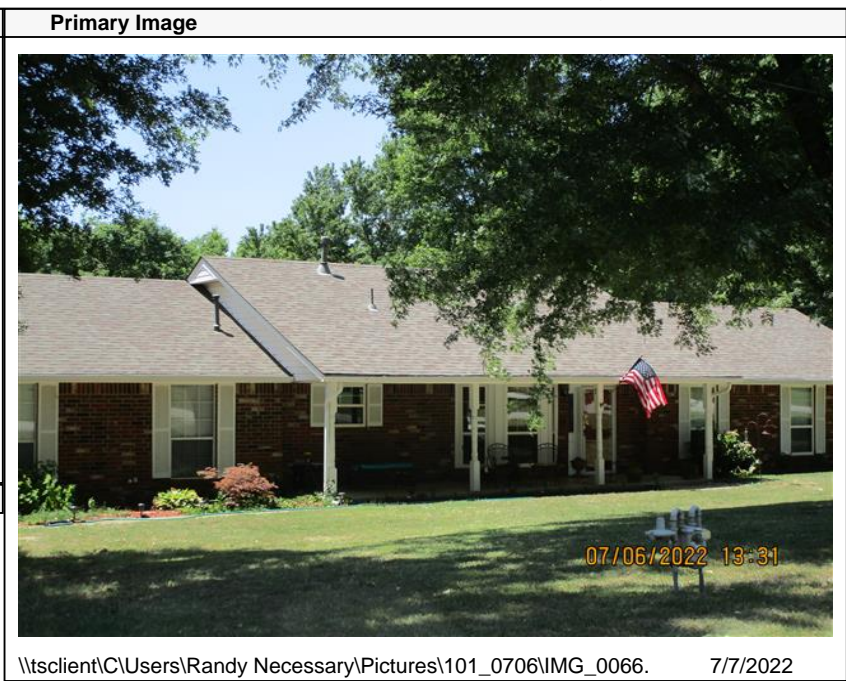
\\tsclient\C\Users\Randy Necessary\Pictures\101_0706\IMG_0066. 7/7/2022