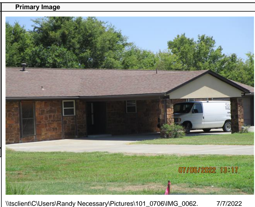
\\tsclient\C\Users\Randy Necessary\Pictures\101_0706\IMG_0062. 7/7/2022