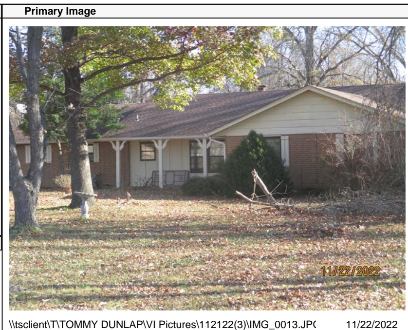
\\tsclient\T\TOMMY DUNLAP\VI Pictures\112122(3)\IMG_0013.JPG 11/22/2022