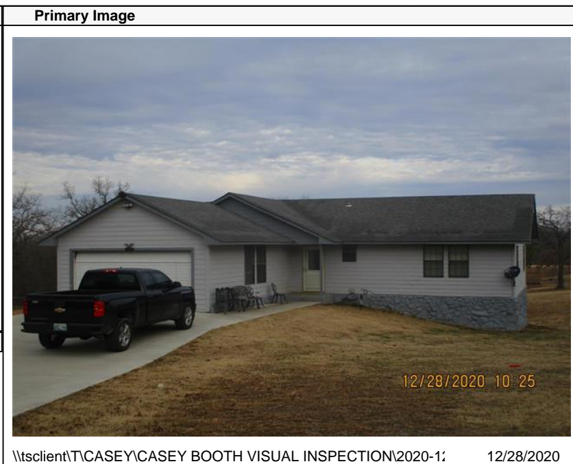
\\tsclient\TCASEY\CASEY BOOTH VISUAL INSPECTION\2020-1; 12/28/2020