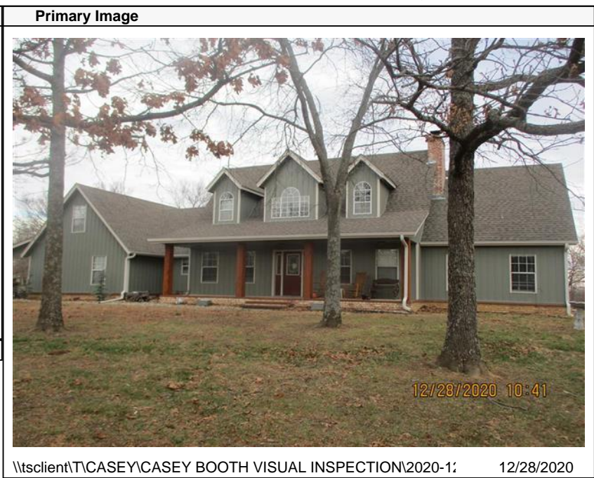
\\tsclient\TCASEY\CASEY BOOTH VISUAL INSPECTION\2020-1; 12/28/2020