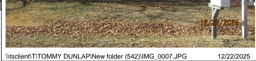
\\tsclient\T\TOMMY DUNLAP\New folder (542)\IMG_0007.JPG 12/22/2025