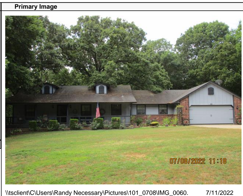
\\tsclient\C\Users\Randy Necessary\Pictures\101_0708\IMG_0060. 7/11/2022