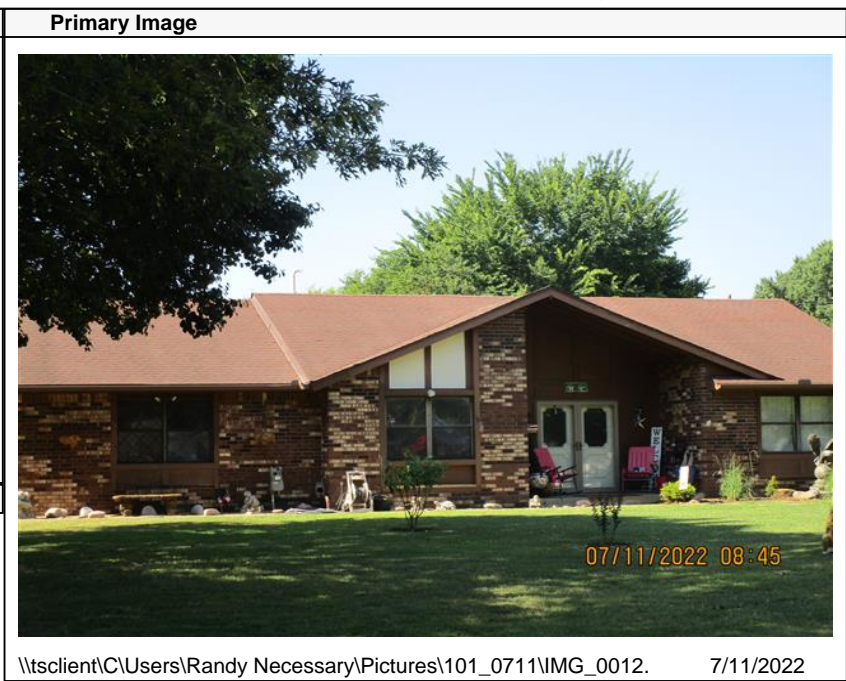
\\tsclient\C\Users\Randy Necessary\Pictures\101_0711\IMG_0012. 7/11/2022