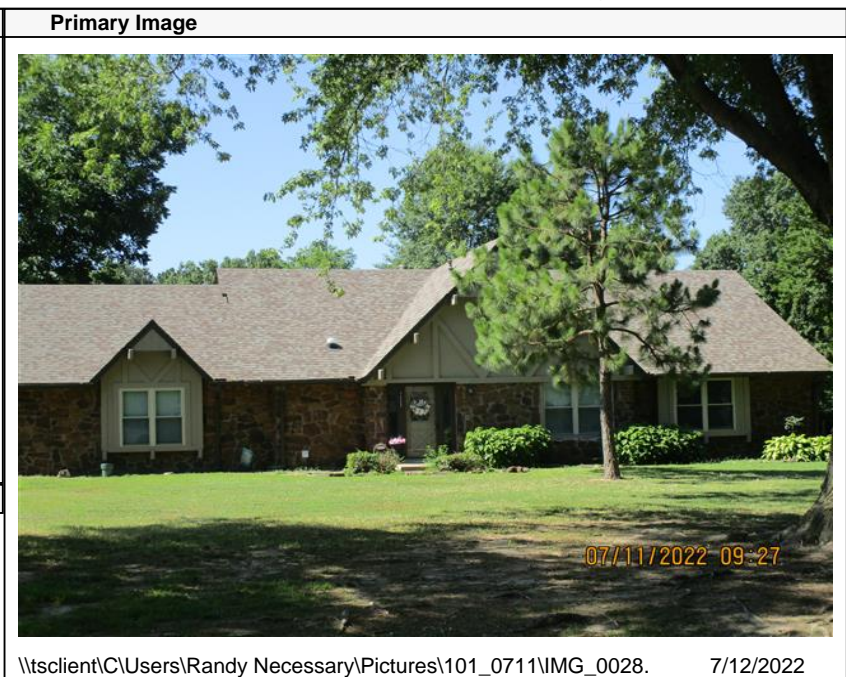
\\tsclient\C\Users\Randy Necessary\Pictures\101_0711\IMG_0028. 7/12/2022