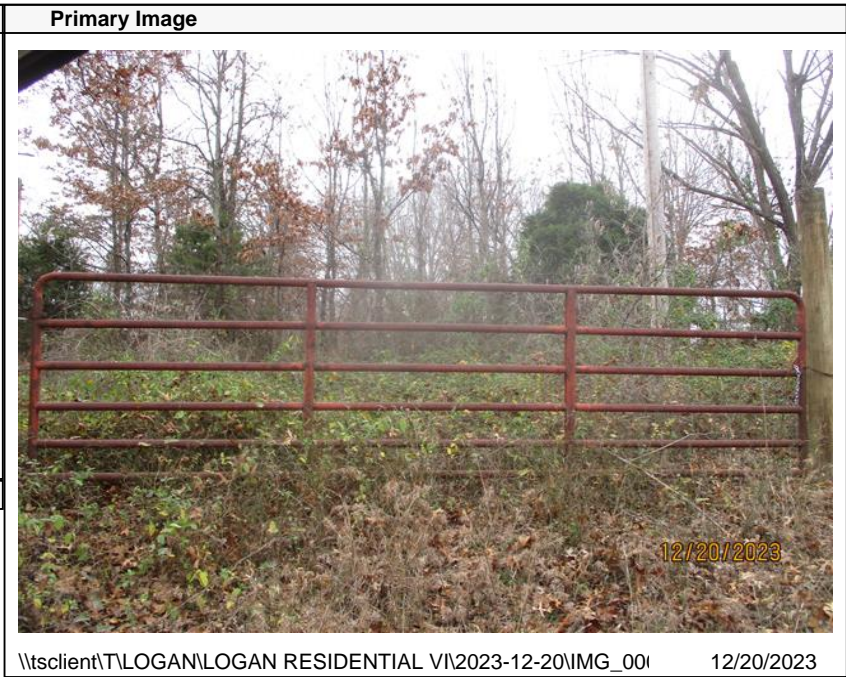
\\tsclient\T\LOGAN\LOGAN RESIDENTIAL VI\2023-12-20\IMG_001 12/20/2023