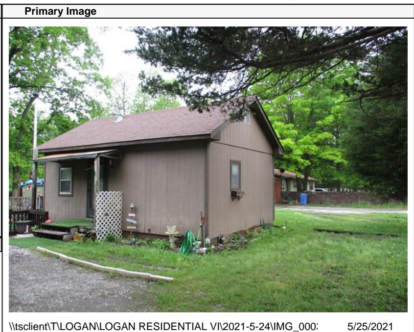
\\tsclient\T\LOGAN\LOGAN RESIDENTIAL VI\2021-5-24\IMG_000: 5/25/2021