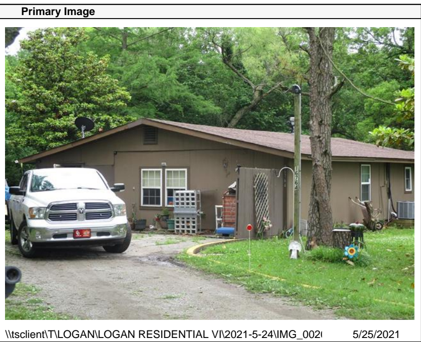
\\tsclient\T\LOGAN\LOGAN RESIDENTIAL VI\2021-5-24\IMG_002I 5/25/2021