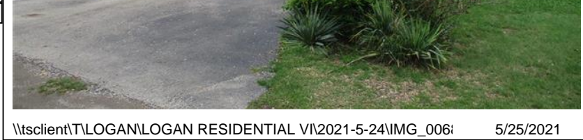
\\tsclient\T\LOGAN\LOGAN RESIDENTIAL VI\2021-5-24\IMG_006i 5/25/2021