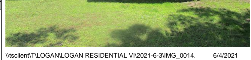
\\tsclient\T\LOGAN\LOGAN RESIDENTIAL VI\2021-6-3\IMG_0014. 6/4/2021