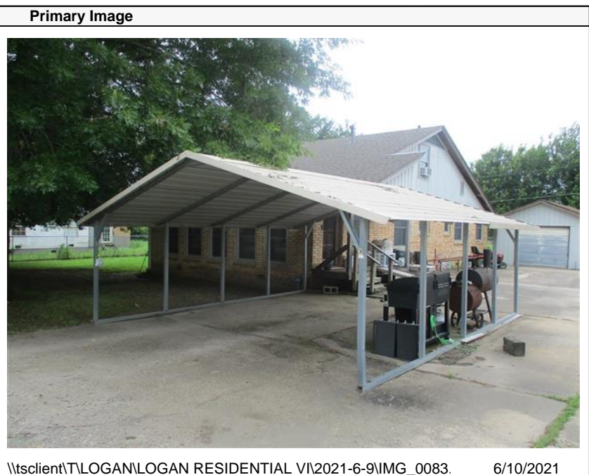
\\tsclient\T\LOGAN\LOGAN RESIDENTIAL VI\2021-6-9\IMG_0083. 6/10/2021