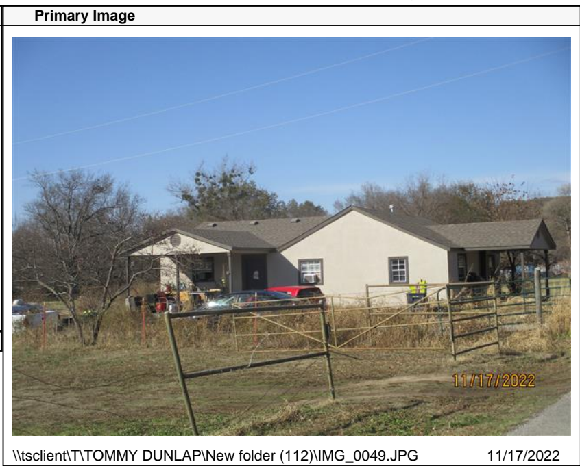
\\tsclient\T\TOMMY DUNLAP\New folder (112)\IMG_0049.JPG 11/17/2022